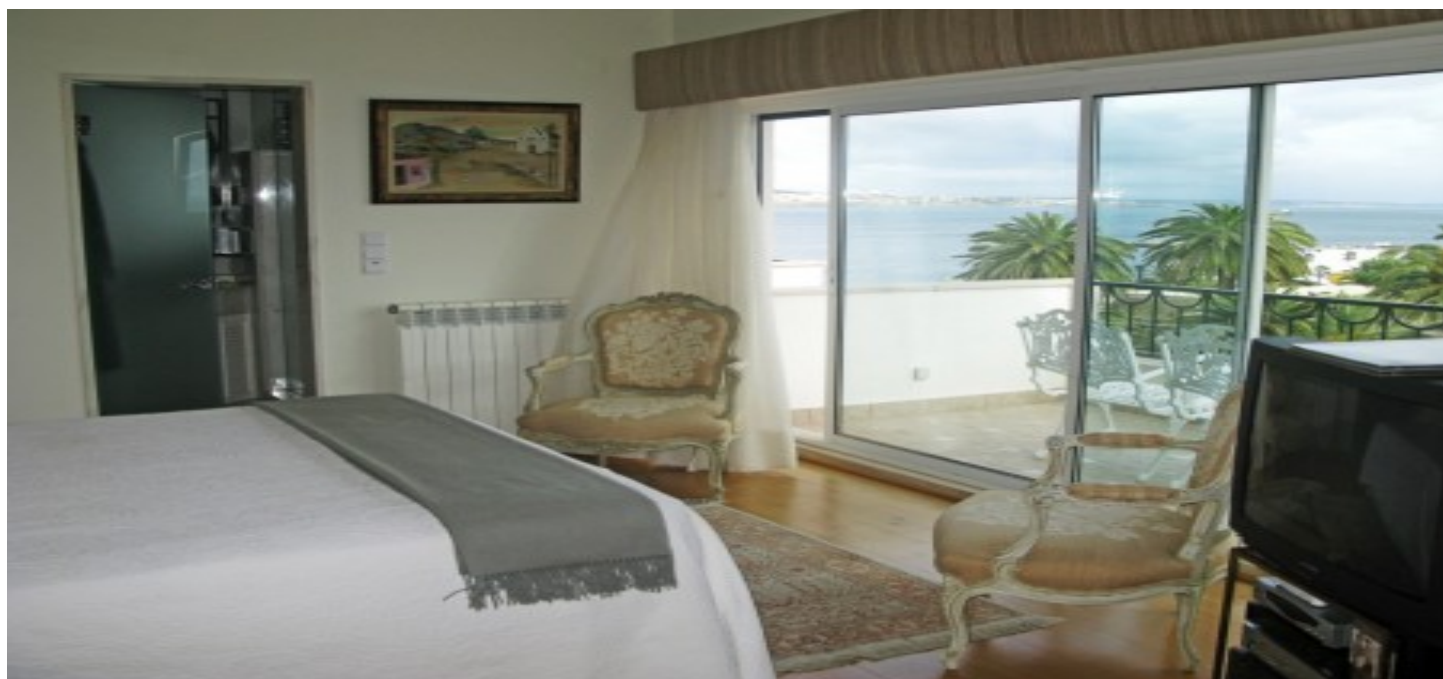
T2 ? 2 Bedrooms Apartment